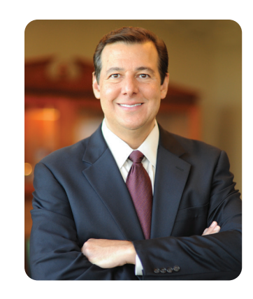
To Our Shareholders, Employees & Partners:

We opened our new headquarter offices at the Broadwest campus in the Vanderbilt/West End corridor of Nashville. Our move allows the company to accommodate our growth, support our team, and better serve our international base of customers and partners.